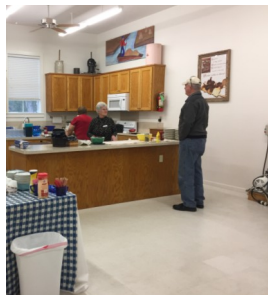
Ladies cooking our Noodle lunch