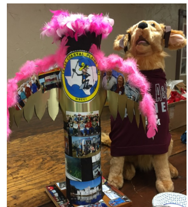
Aggie with Historic TCPU to-