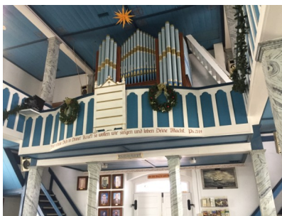
Beautiful Pipe Organ